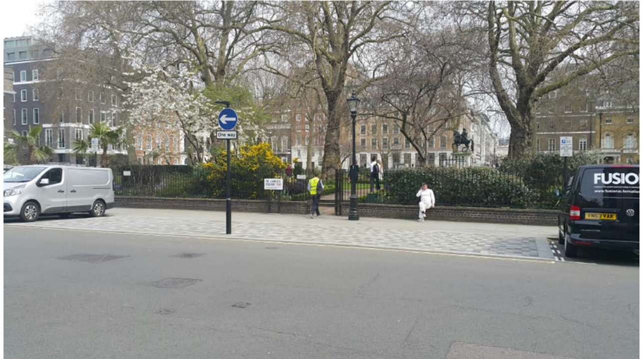
Footway on the south-west side of St James Square, opposite the junction with King Street